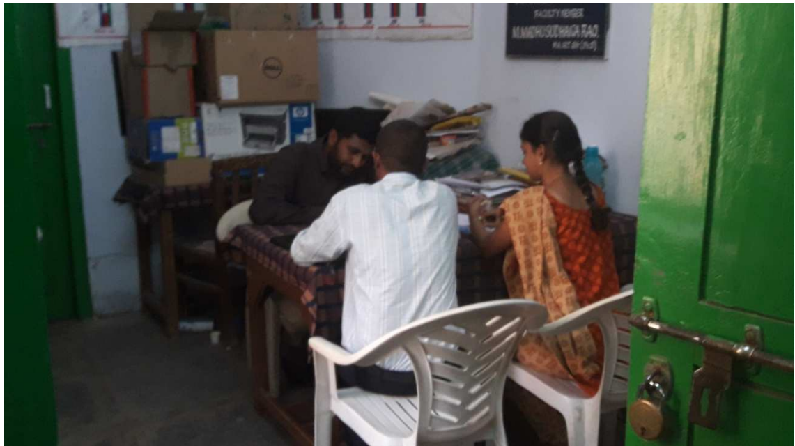
Company HR conducting Personal Interview .