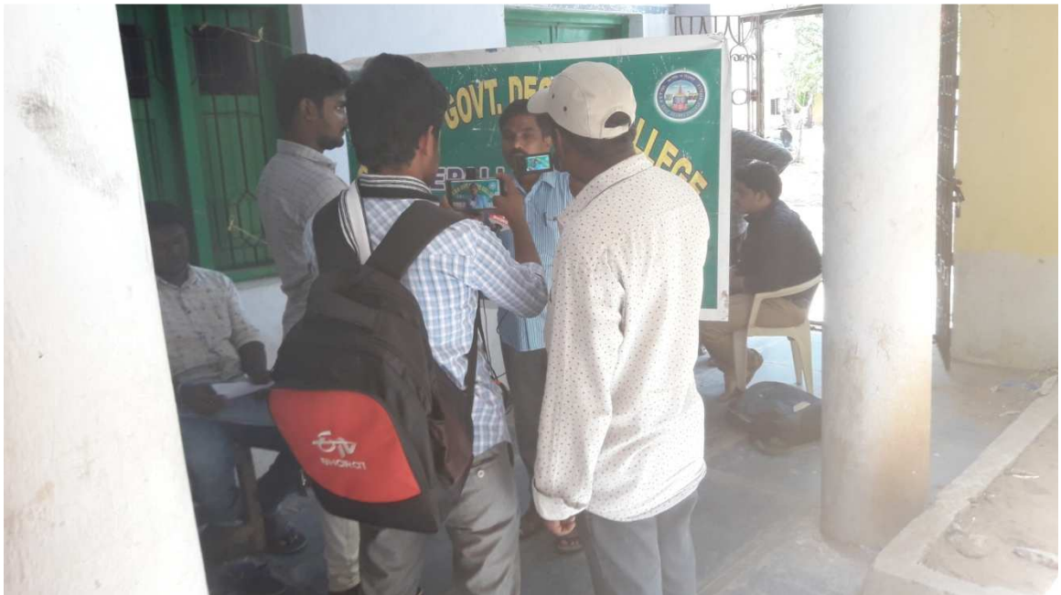
Media Coverage About Job Drive at JKC of Sri ABR Govt Degree College Repalle