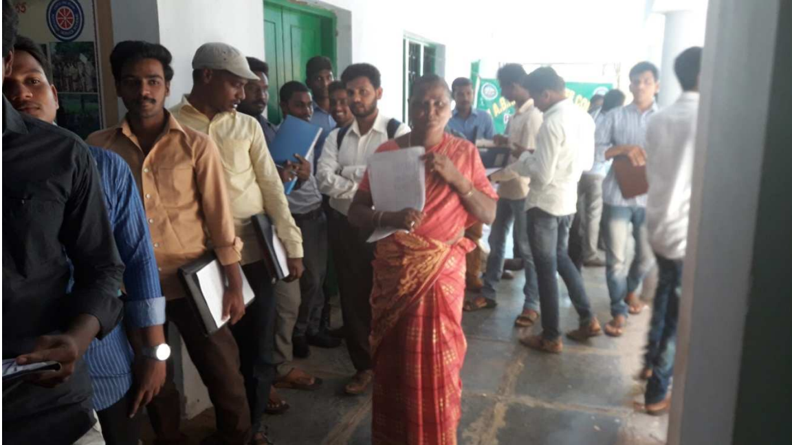
Students waiting for personal Interview after Written Test