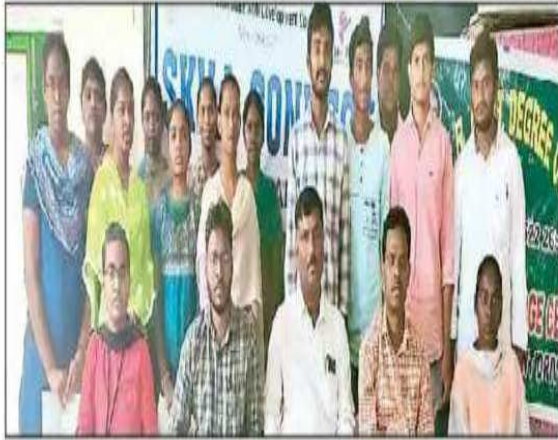
ఎంపికైన విద్యార్థులతో అధ్యాకులు, నిర్వాహకులు