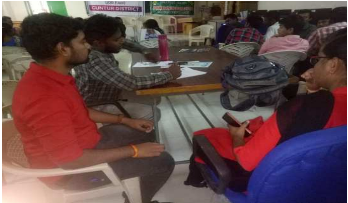
Company HR conducting Personal Interview .