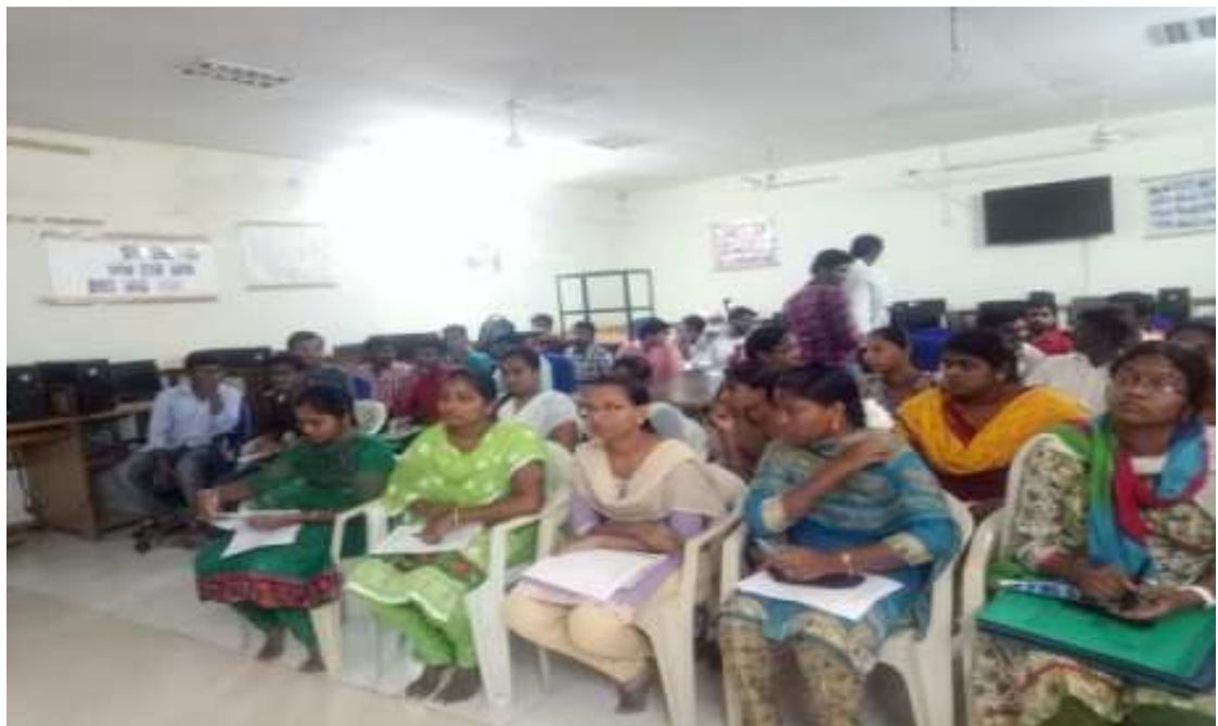
Students attending the Job drive