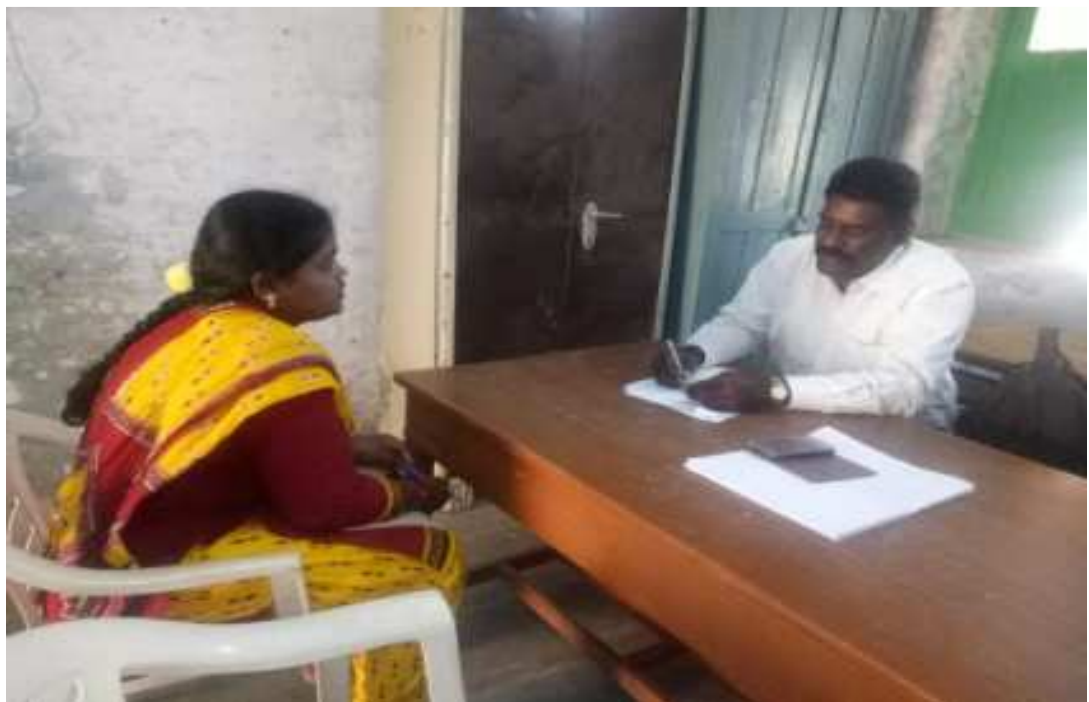
Company Hr Conducting personal Interview.