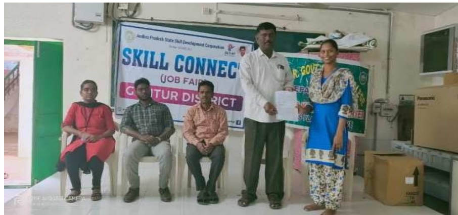
Certificate Distribution to the selected students.