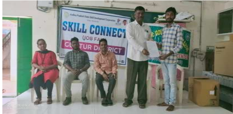
Certificate Distribution to the selected students.