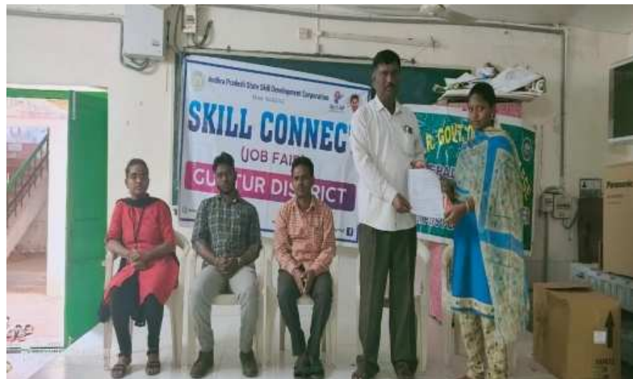
Certificate Distribution to the selected students.